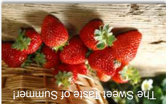
The Sweet Taste of Summer!

Nonprofit Organization U.S. POSTAGE PAID Hot Springs, AR Permit No. 185